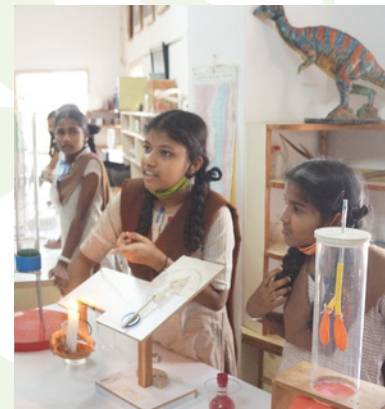
800 students & teachers receive education assistance and resources in Maths and Science