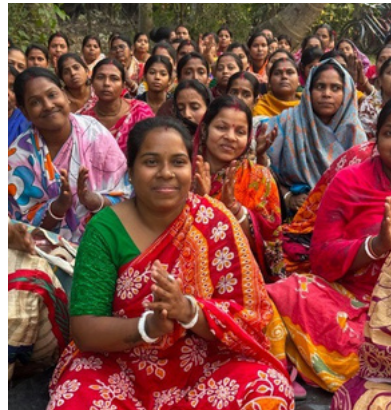
550 mothers with micro loans and peer support groups

YGB's global community is making a real difference in the lives of more than 3,500 women and children: