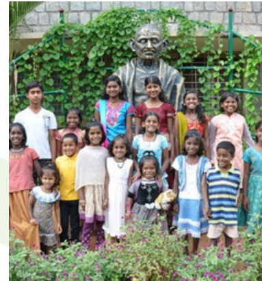
38 abandoned children with loving group home care and high-quality education