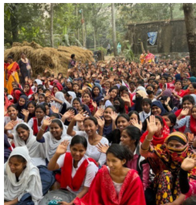
460 youths to receive a five year Scholarship for Higher Education (SHE)