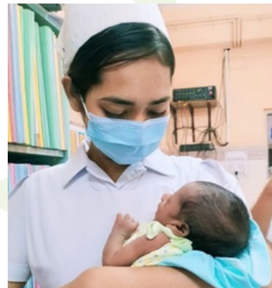
300 youths graduate with college degrees and build independent lives, helping families and becoming the change