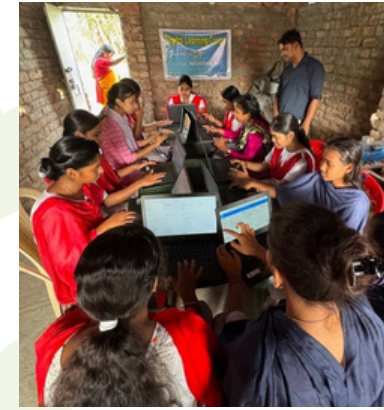
600 young girls receive computer skills training