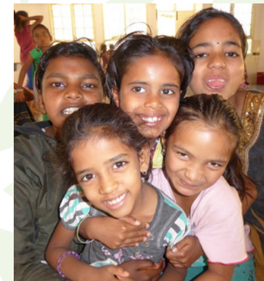
More women & children to receive life-changing support in 2025, thanks to our generous partnerships