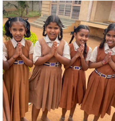
600 young girls to continue their primary education